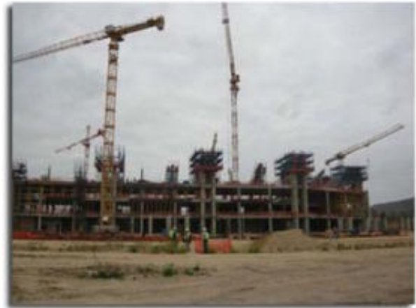
Presidential visit to Mbombela stadium in Mpumalanga