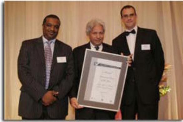
Visionary Client: SANRAL