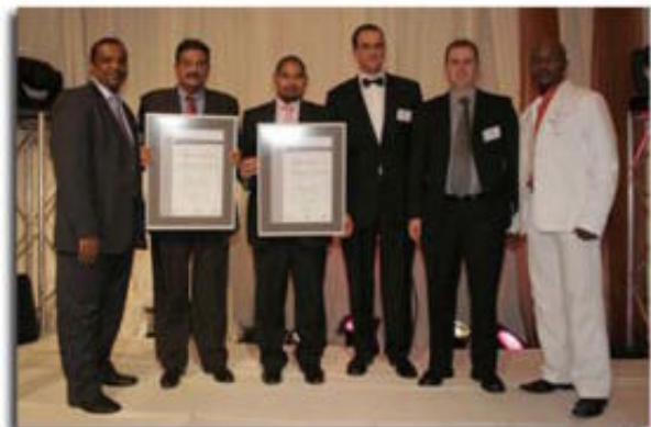
Africon in conjunction with Iliso