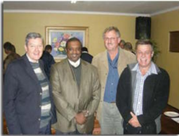
Presidential visit to the Free State