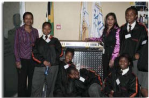
Runner Up: Arup