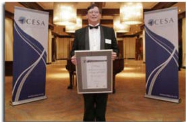
International Business Developer: UWP Consulting Africa