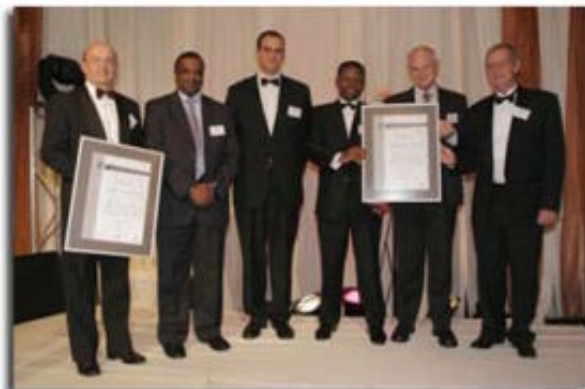
Berg River Consultants Joint Venture