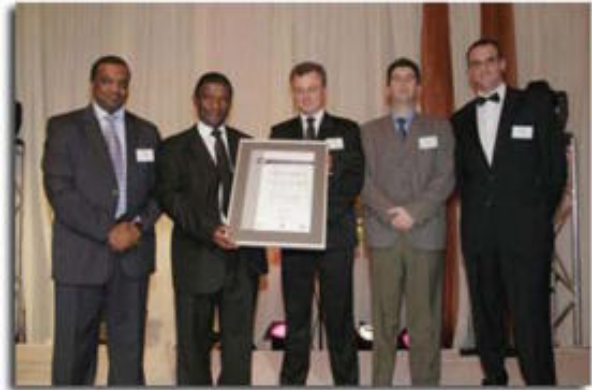
Stemele Bosch Africa