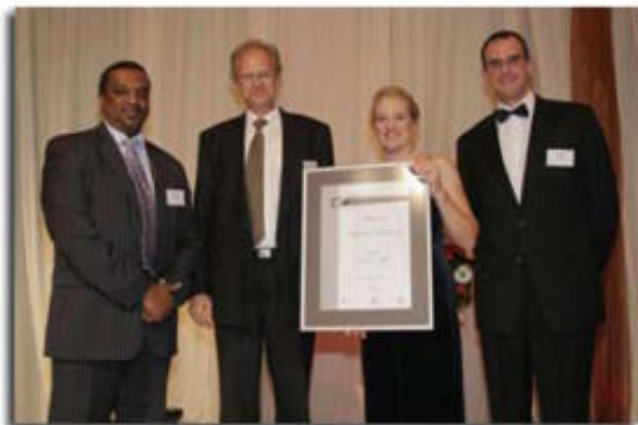
Business Excellence: Golder Associates