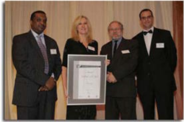
Publisher: 3S Media