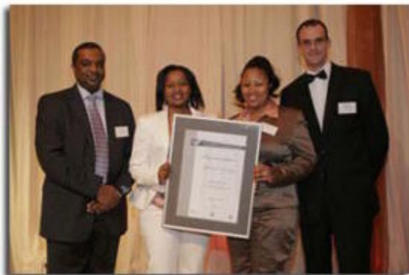
Young Company: Ithembaletu