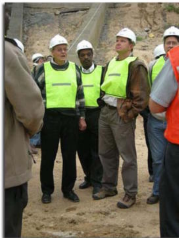
Presidential visit to the Free State